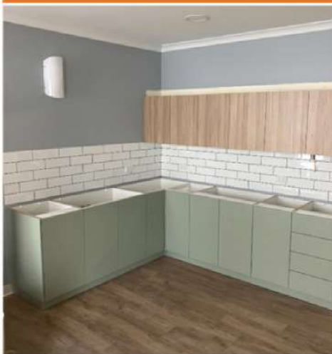
New colour scheme and cabinetry in TCP