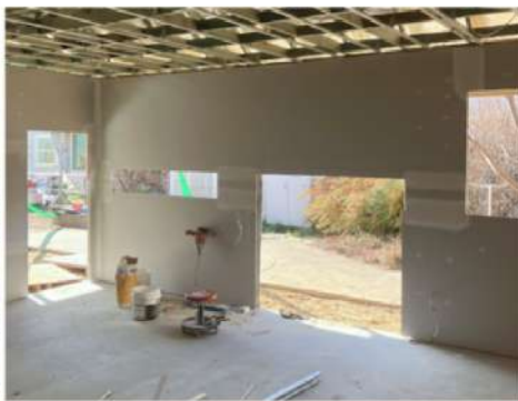
Staff lounge/dining area extension

The program of works continues to progress well, and is on schedule, for all services to be back on site for Christmas.