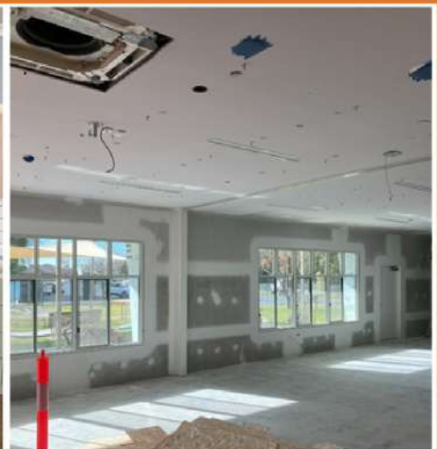
Social Support Room is progressing