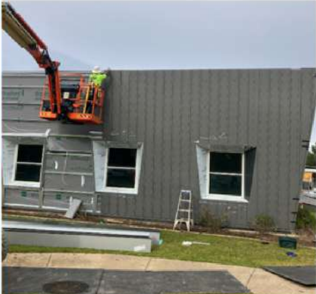
External cladding is nearing completion

Installation of the external cladding is almost complete. The new colour complements the surrounding environment nicely, and is a vast improvement on the black plastic wrapping we have been looking at for over twelve months.