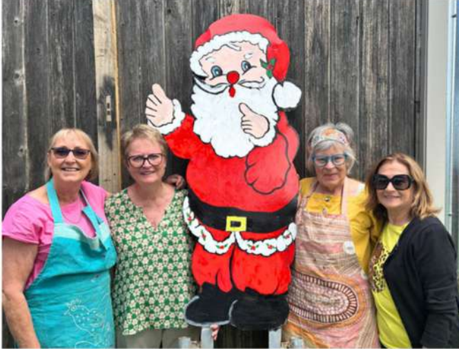
Our Casual Art Group took on a special project, giving some of the Lockington township Christmas decorations a spruce up in preparation for the upcoming Festive Season. Thank you to the girls who did a great job upcycling Santa for another year. He's looking so much more jolly in 2024!

Office staffed 8.30am to 5.00pm Tues/Wed/Thurs Ph 0499 170 329 Email nhldbc@gmail.com