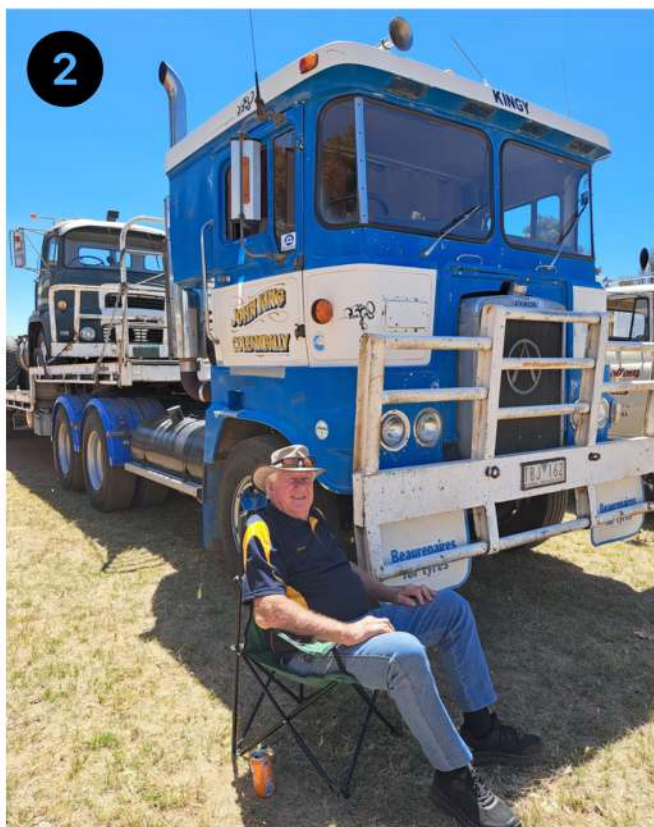
1 AB 160 International, Cummins Diesel, from Heathcote.