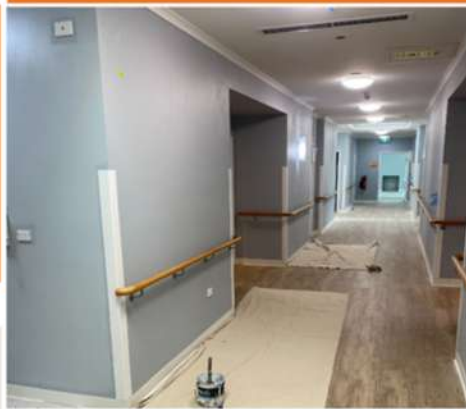
Aged Care Hallway (above), Resident Room (below)