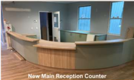
New Main Reception Counter

Campaspe Medical Centre will remain at 14 Village Drive Rochester, until the completion of their new consulting suites at the rear of the hospital in early 2025.